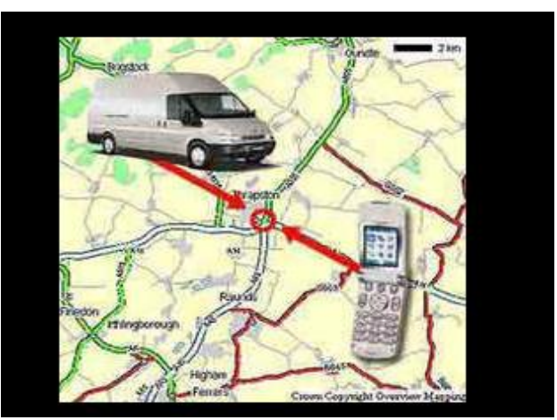
Fig 4.GPS Tracking Location

Initial stage of every electronic circuit is power supply system that provides required power to drive the whole system. The specification of power supply depends on the power requirement and this requirement is determined by its rating. For our project we require + 5 Volt.